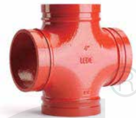
MODEL 5101 STANDARD CROSS