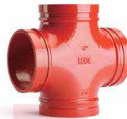
MODEL XGQT05 CROSS